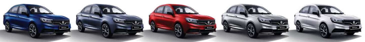
Marine Blue Space Grey Ruby Red Armour Silver Snow White