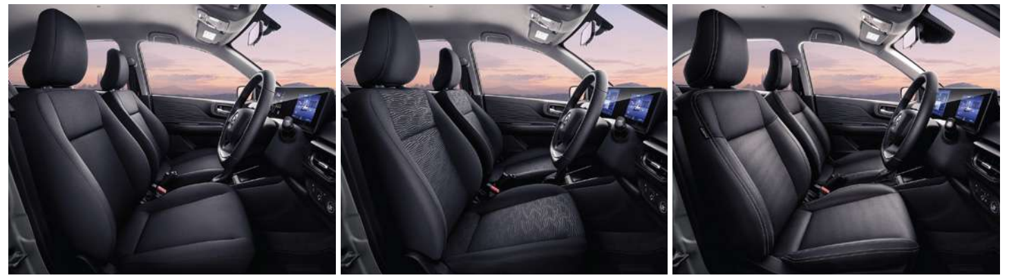
1.5 Standard Fabric Seats 1.5 Executive Textured Fabric Seats 1.5 Premium Leatherette Seats