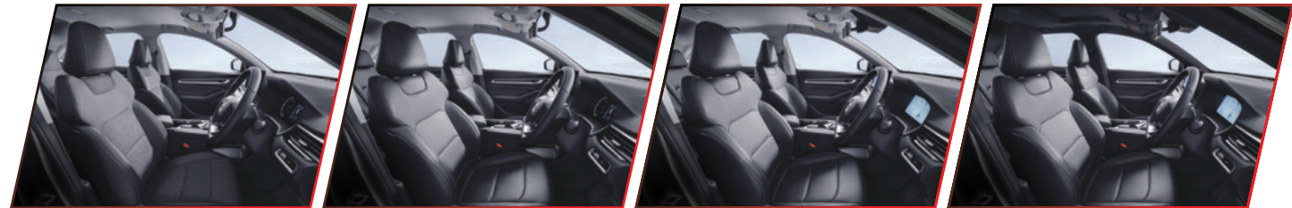
1.5TD Executive Fabric Seats 1.5TD Premium Leatherette Seats 1.5TD Flagship Leatherette Seats 1.5TD Flagship X Leatherette Seats

RUBY RED QUARTZ BLACK SPACE GREY SNOW WHITE MARINE BLUE ARMOUR SILVER