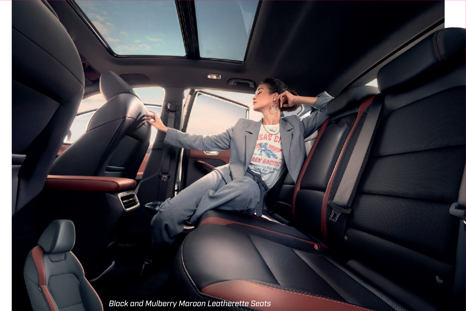
Black and Mulberry Maroon Leatherette Seats