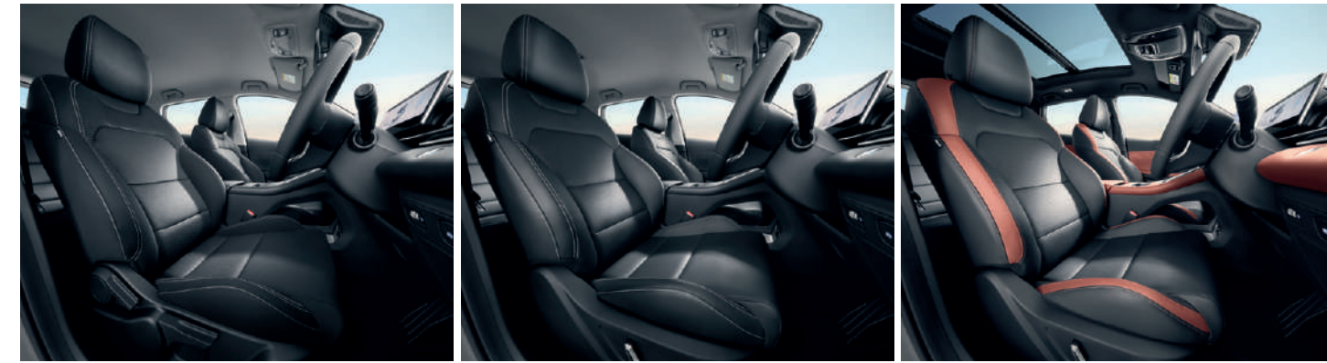
1.5TD Executive Black Fabric Seats